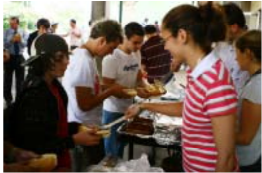
Mel offers sustenance